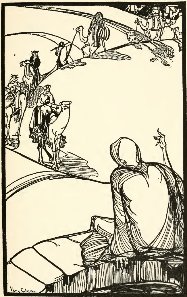
THE DROUGHT SAW A GREAT CARAVAN COME MARCHING TOWARD THE HILL